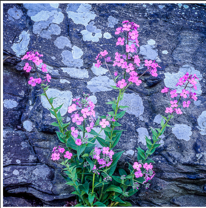
DAME ROCKETS & LICHEN — DELAWARE RIVER WARREN COUNTY, NJ