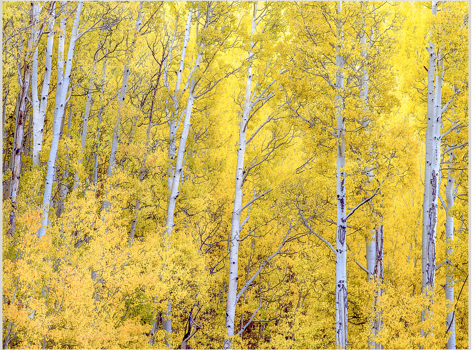
AUTUMN ASPENS — DIXIE NATIONAL FOREST, UT 2002