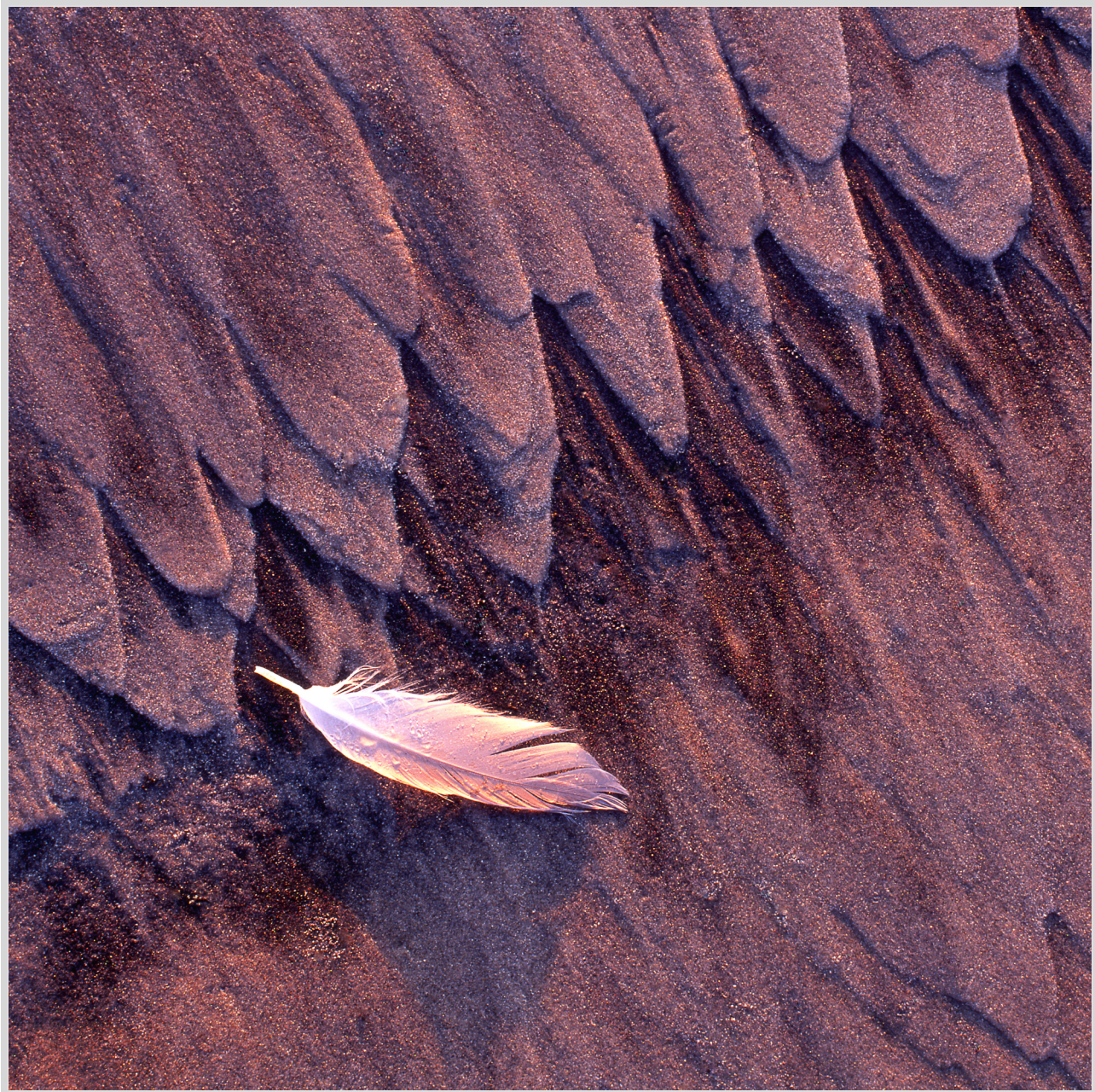
GULL FEATHER AND SAND PATTERNS — DIAMOND BEACH, NJ 2000