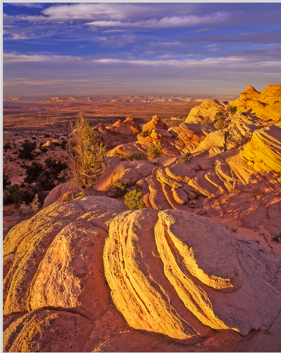
PETRIFIED DUNES — LAKE POWELL NATIONAL RECREATION AREA, AZ 1999