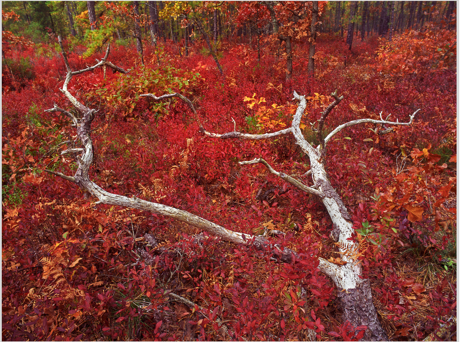
FALLEN SNAG AND BLUEBERRIES — PINELANDS NATIONAL RESERVE, NJ 1994