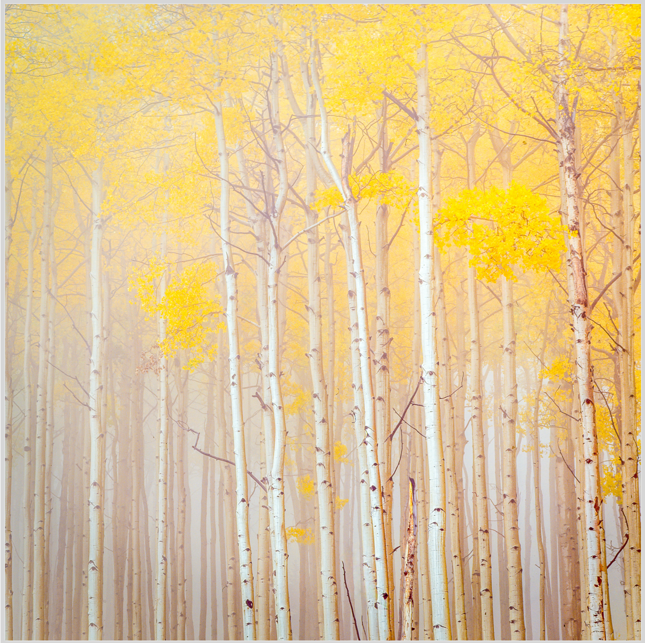
ASPENS IN FOG — SAN JUAN MOUNTAINS, CO 2005