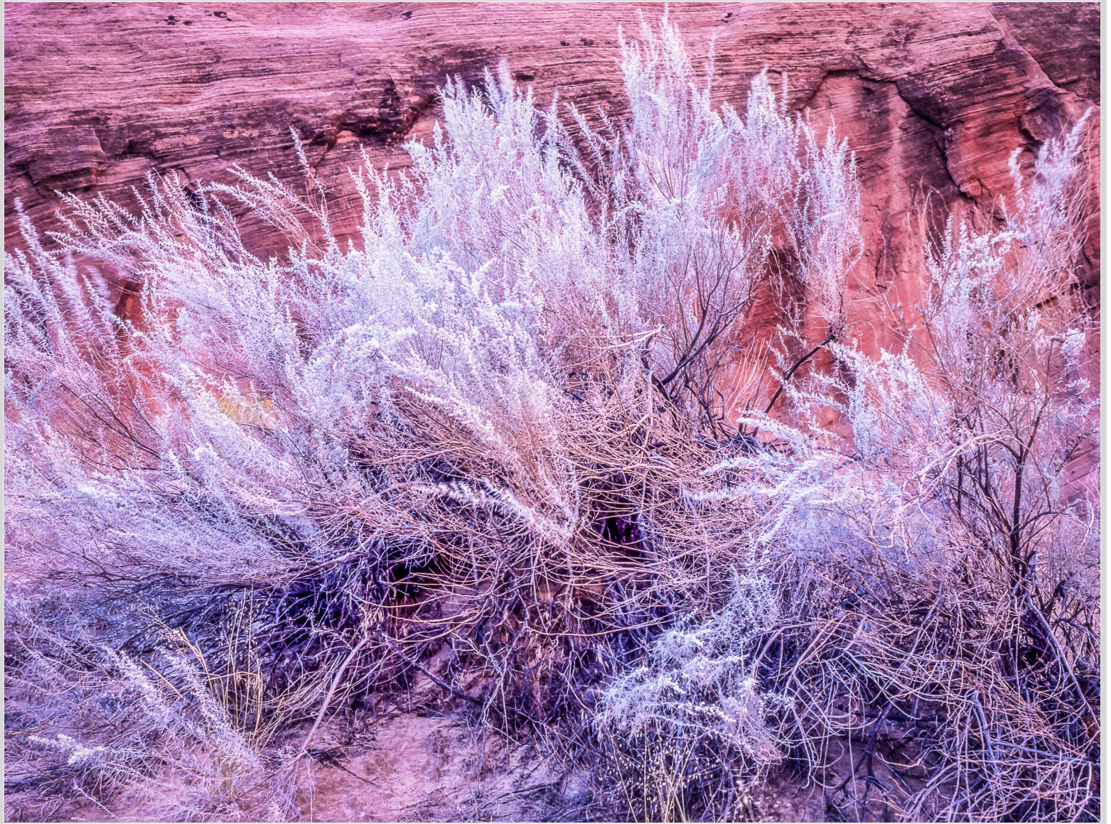
JUNIPER AND CANYON WALL — PARIA RIVER, UT 1999