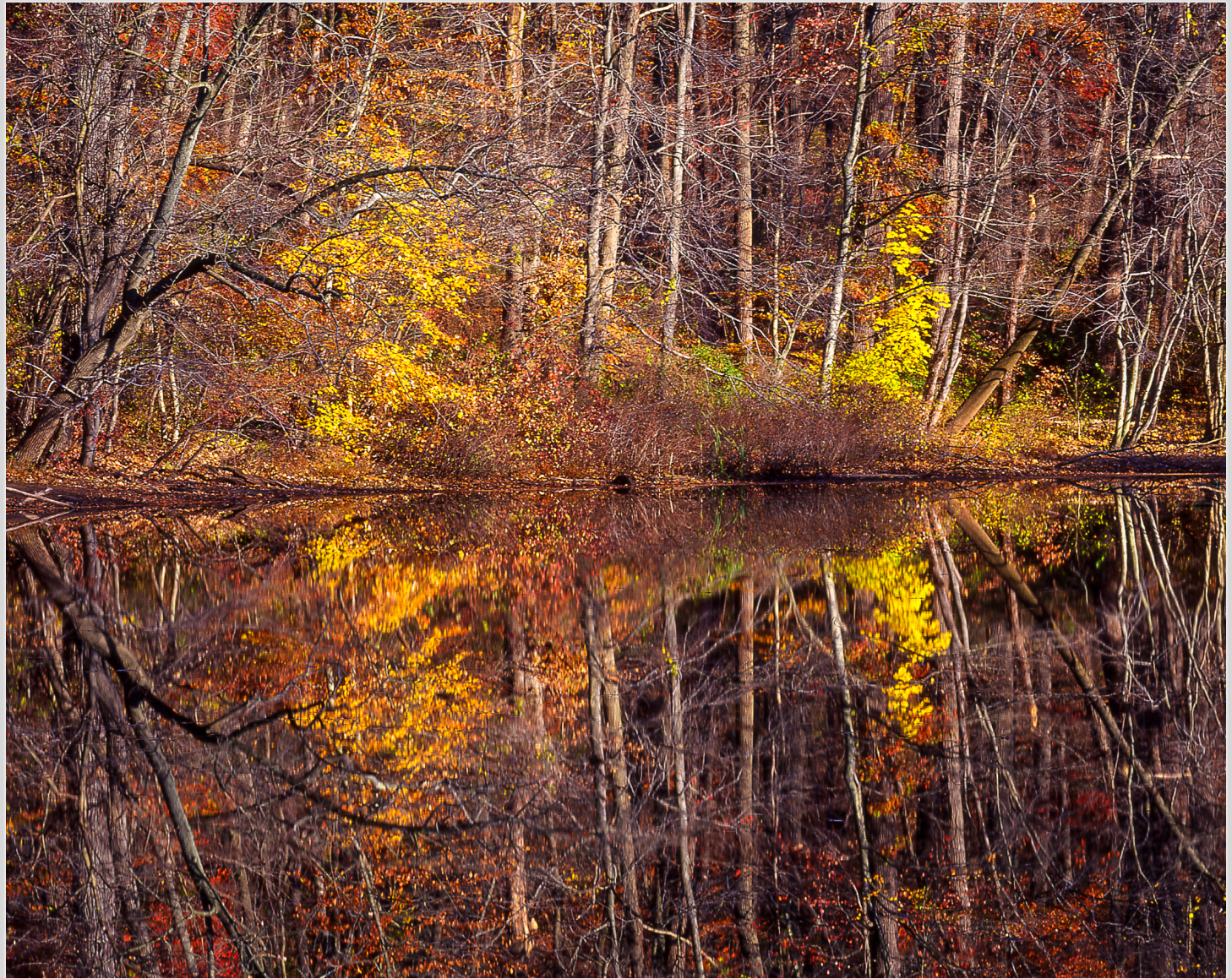
REFLECTIONS AT SURPRISE LAKE — WATCHUNG RESERVATION, NJ 2001