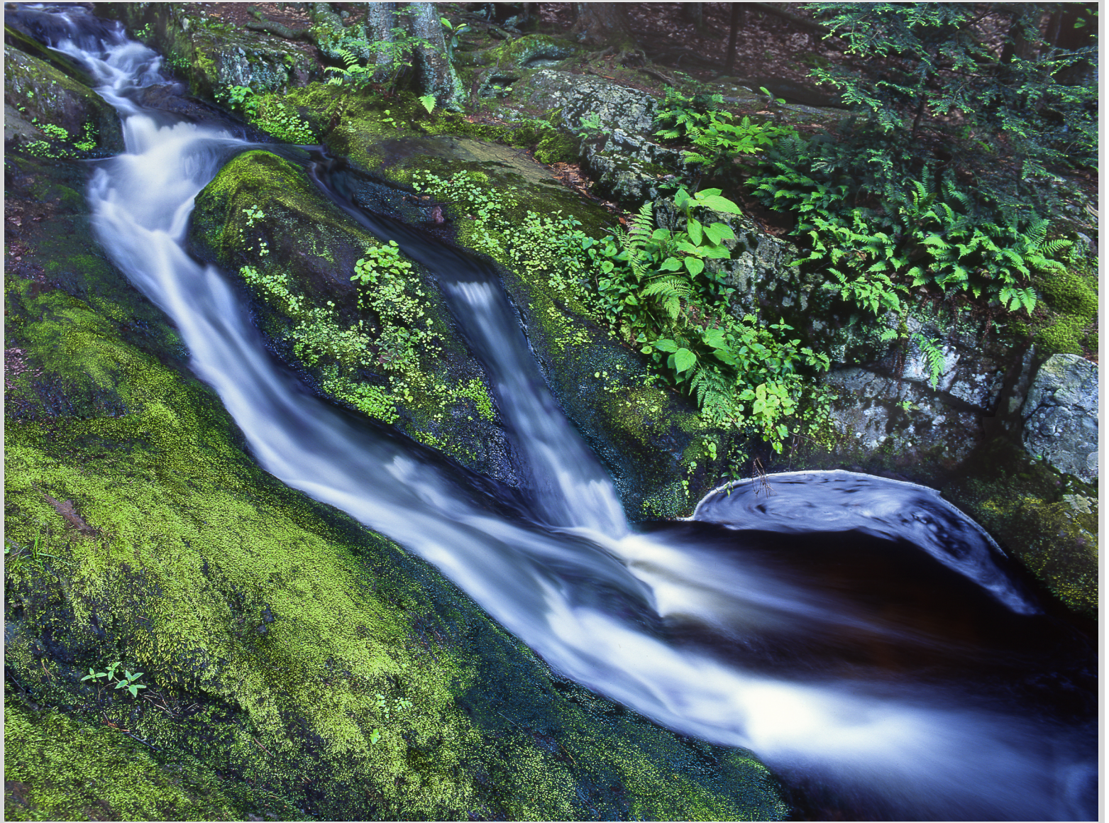
TILLMAN RAVINE — STOKES STATE FOREST, NJ