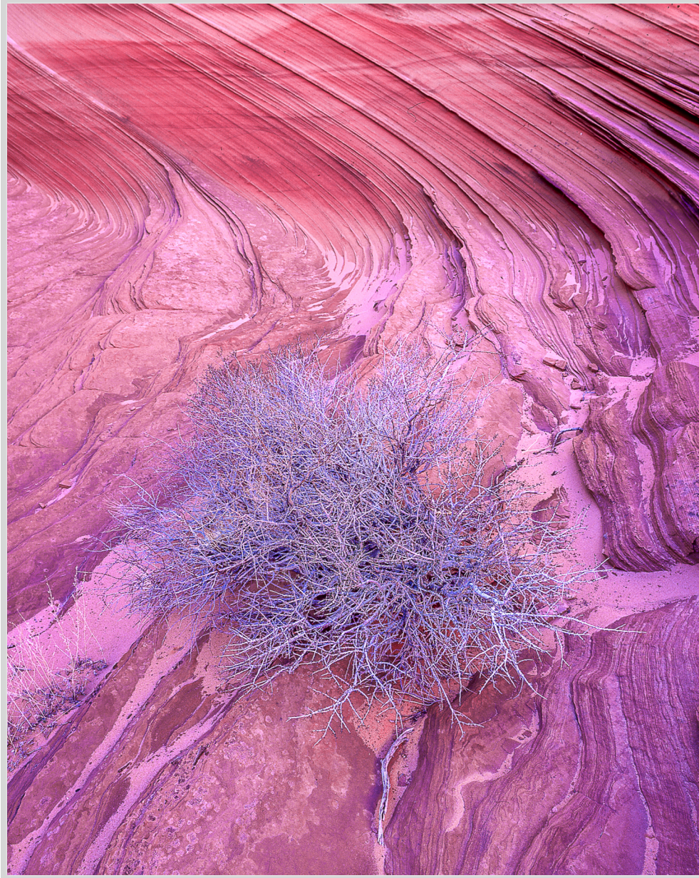
SKELETON BUSH AND SANDSTONE — COYOTE BUTTES, AZ 2001