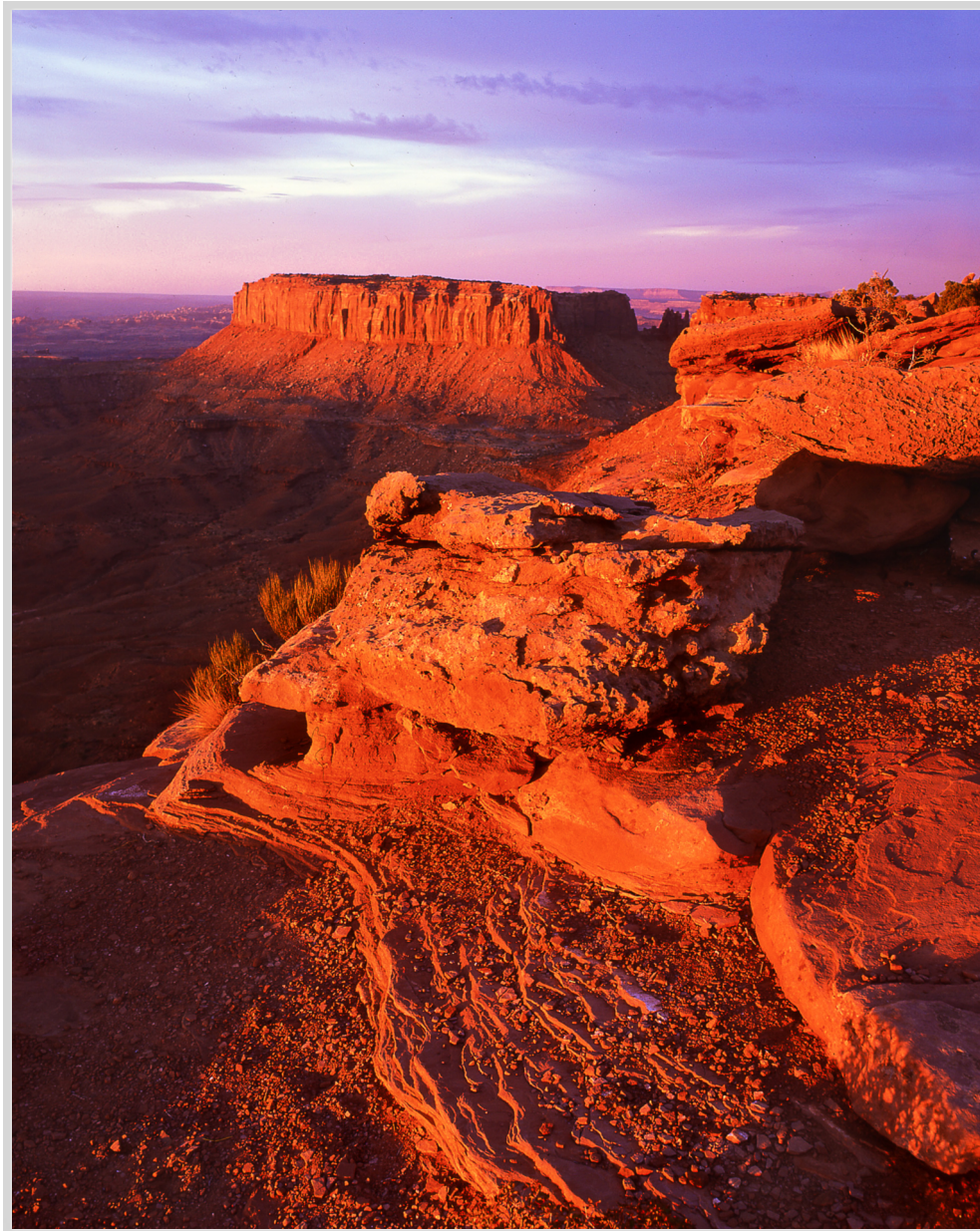
JUNCTION BUTTE — CANYONLANDS NATIONALPARK, UT 2004