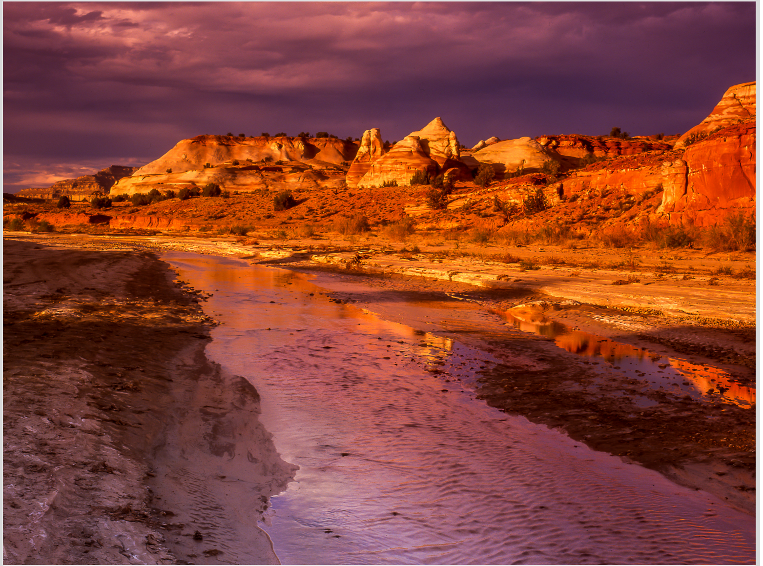
CLEARING STORM AND THE PARIA RIVER — VERMILLION CLIFFS WILDERNESS, UT 2004