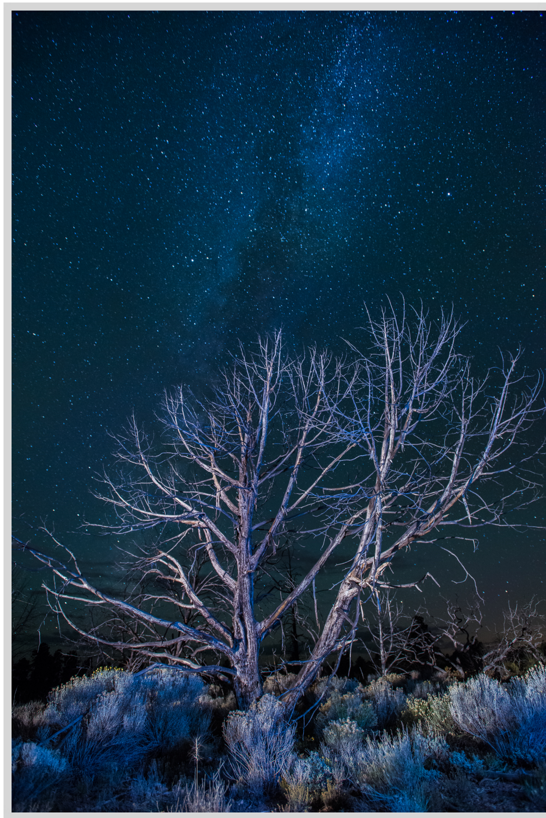
MILKY WAY AND SNAGS — GRAND CANYON SOUTH RIM, AZ