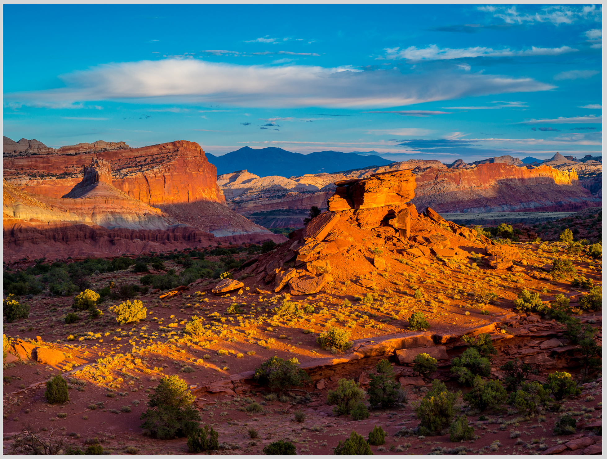
LATE AFTERNOON — CAPITAL REEF NATIONAL PARK, UTAH