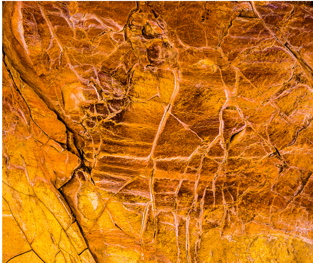
ROCK STAINS SAN JUAN MOUNTAINS, CO