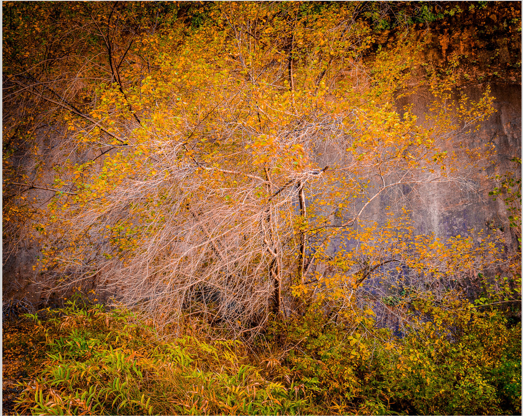
REFLECTED LIGHT IN CALF CREEK CANYON — GRAND STAIRCASE-ESCALANTE NATIONAL MONUMENT, UT