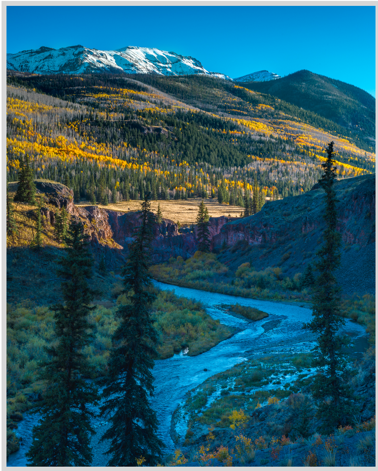
LAKE FORK ABOVE LAKE SAN CRISTOBAL, CO