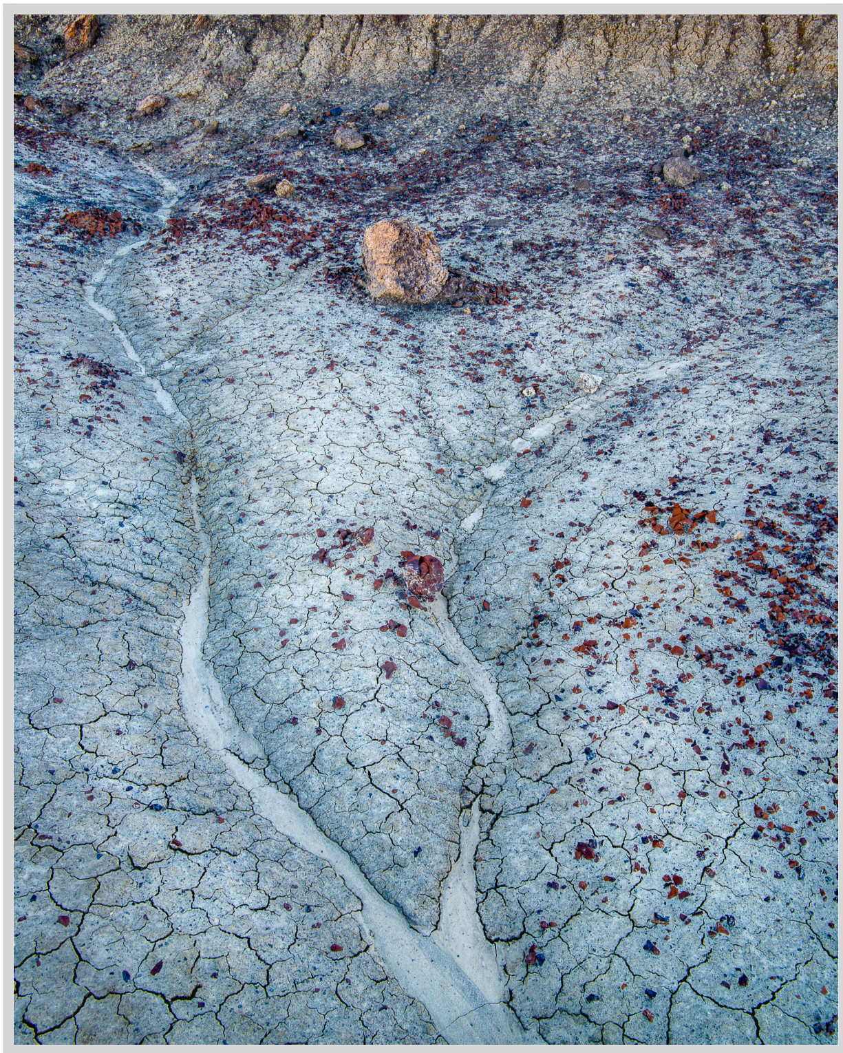
WATERWAYS — BISTI/DE-NA-ZEN WILDERNESS, NM