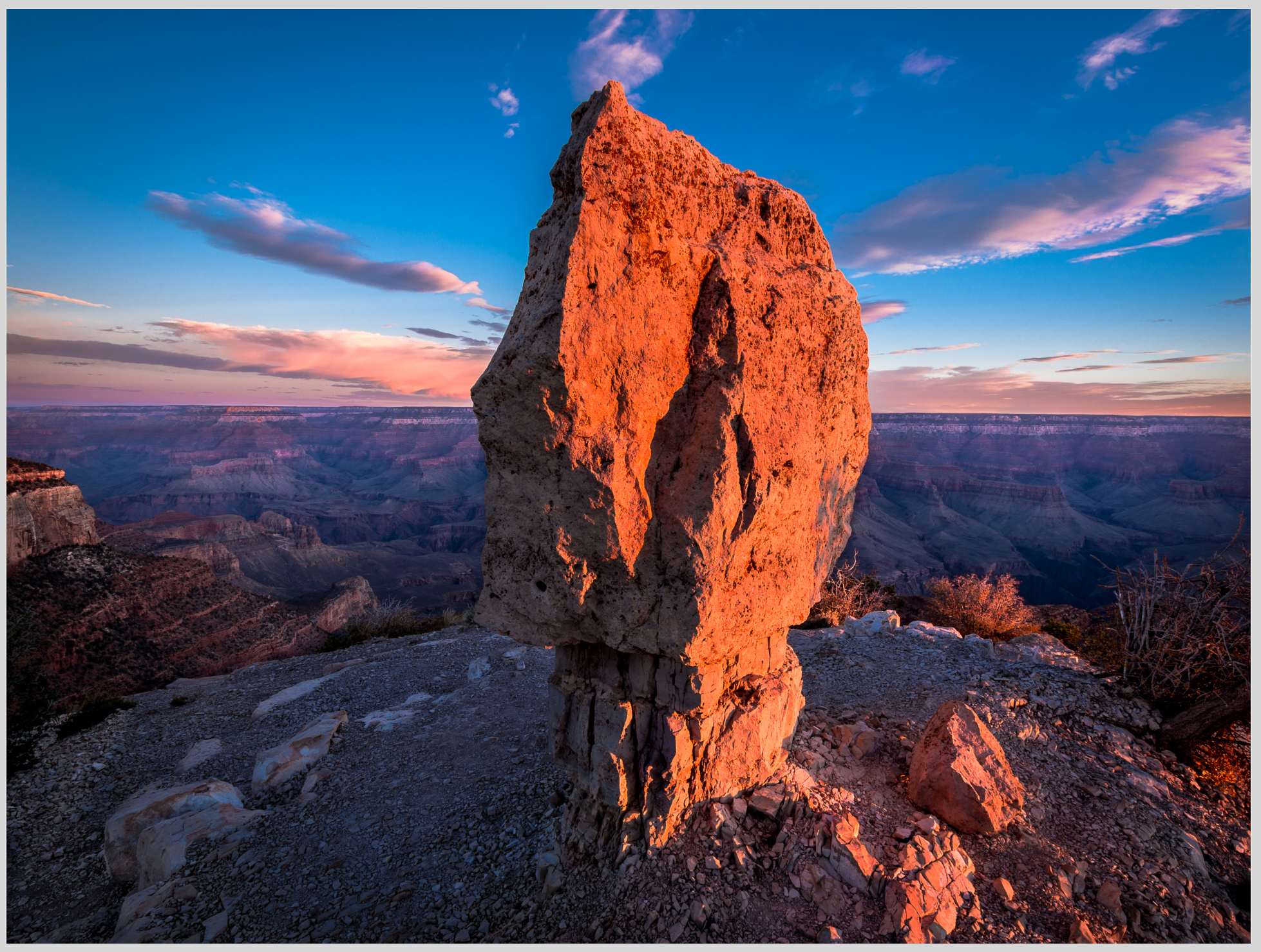
EARLY LIGHT AT SHOSHONE POINT — GRAND CANYON SOUTH RIM, AZ