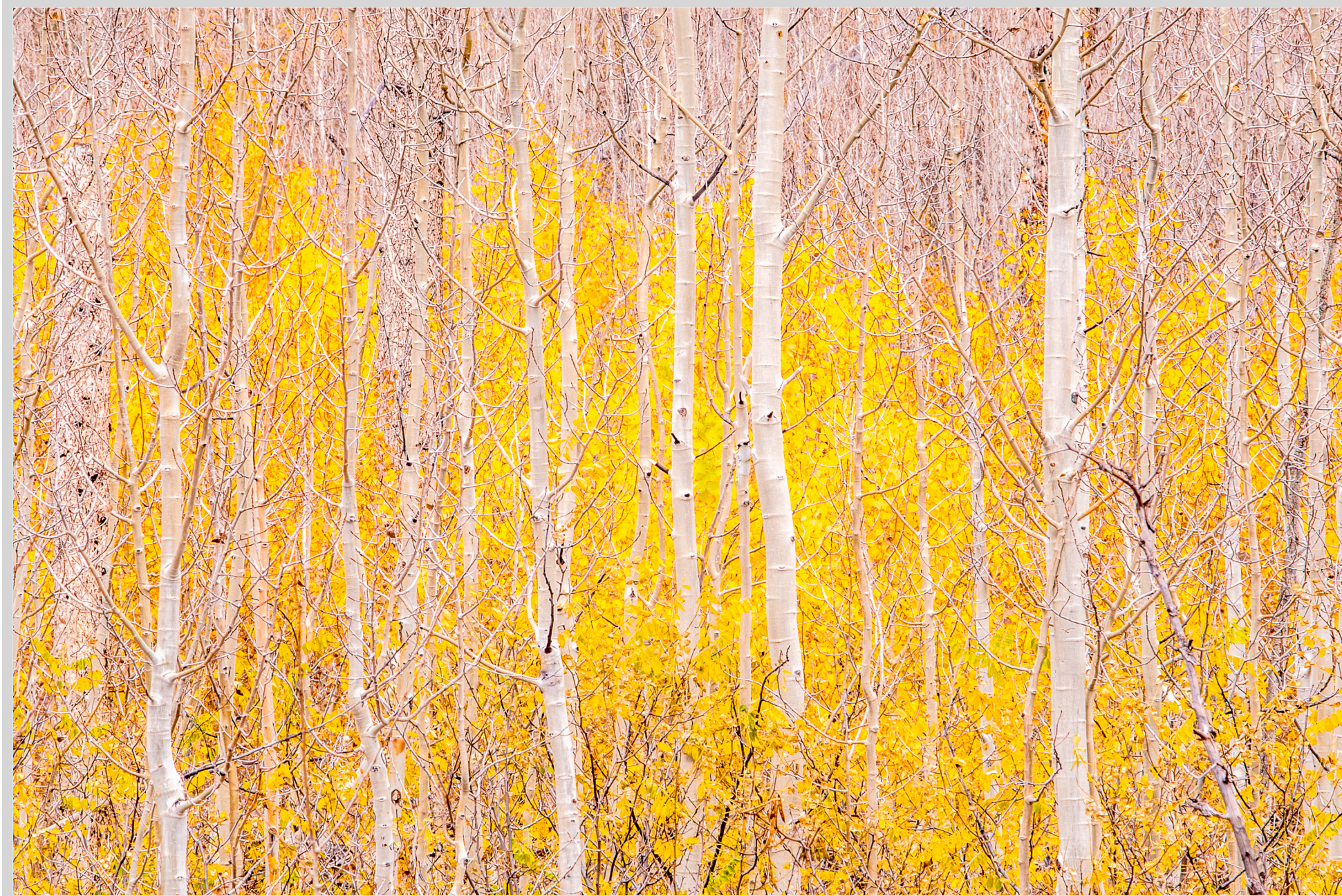
YOUNG ASPEN GROVE — GRAND CANYON NORTH RIM, AZ