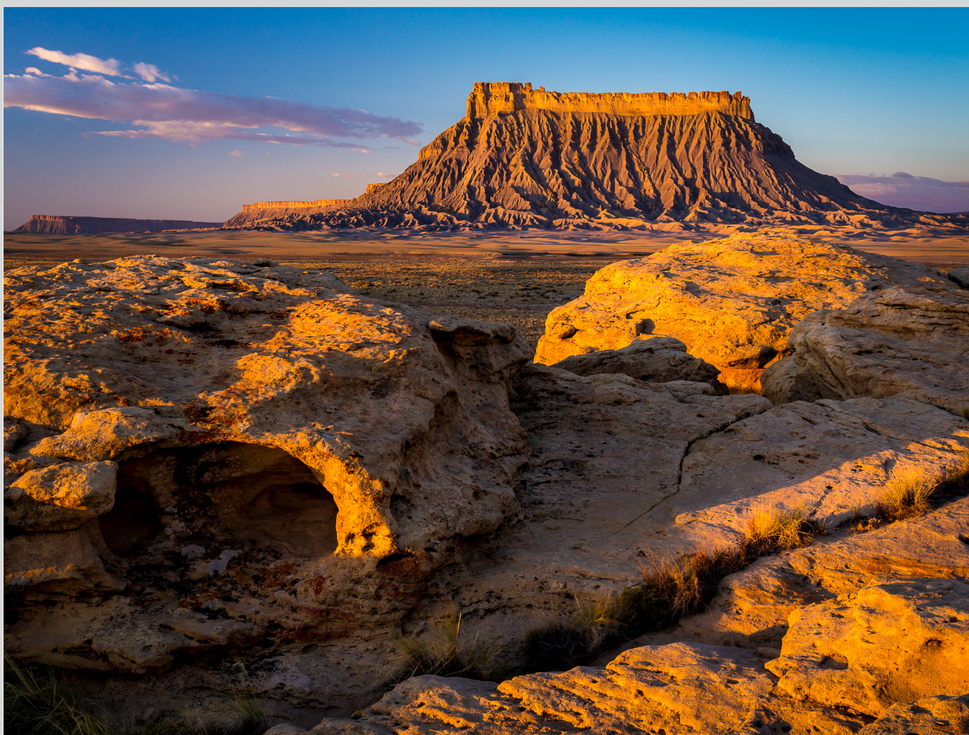
MORNING LIGHT ON FACTORY BUTTE — FACTORY BUTTE RECREATION AREA, UT