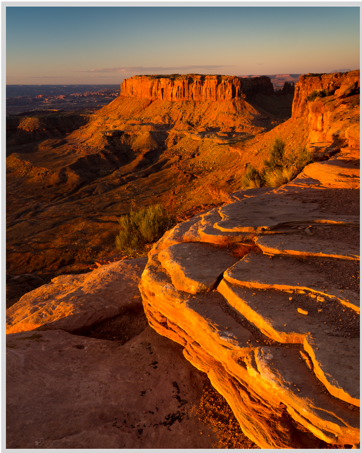
JUNCTION BUTTE AT SUNRISE — CANYONLANDS NATIONAL PARK, UT