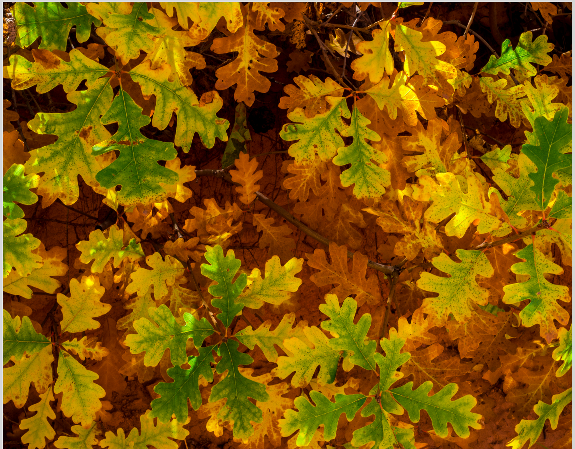
AUTUMN OAKS IN CALF CREEK CANYON — GRAND STAIRCASE-ESCALANTE NATIONAL MONUMENT, UT