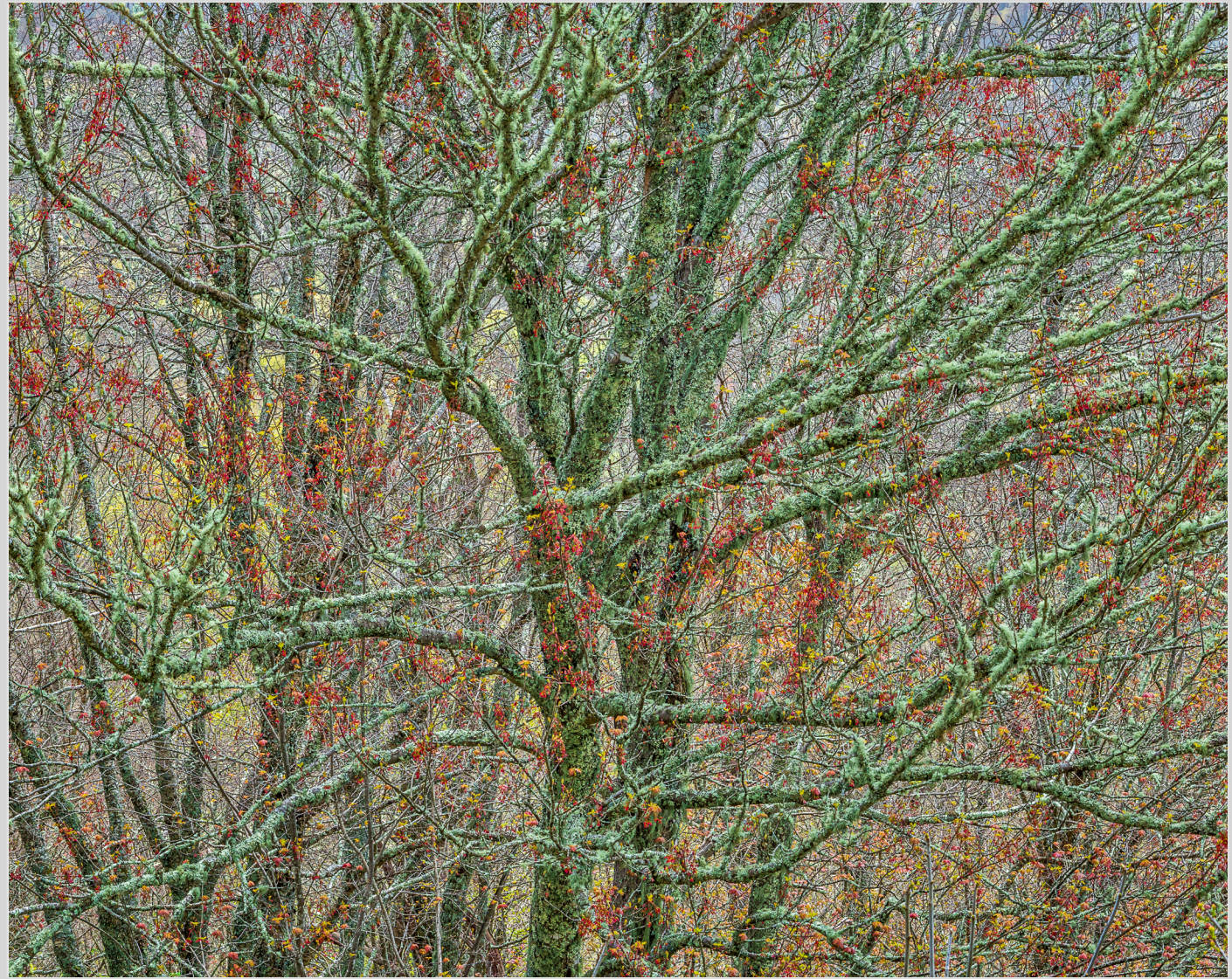
EMERGING MAPLE BUDS — GRAVEYARD FIELDS AREA 2015