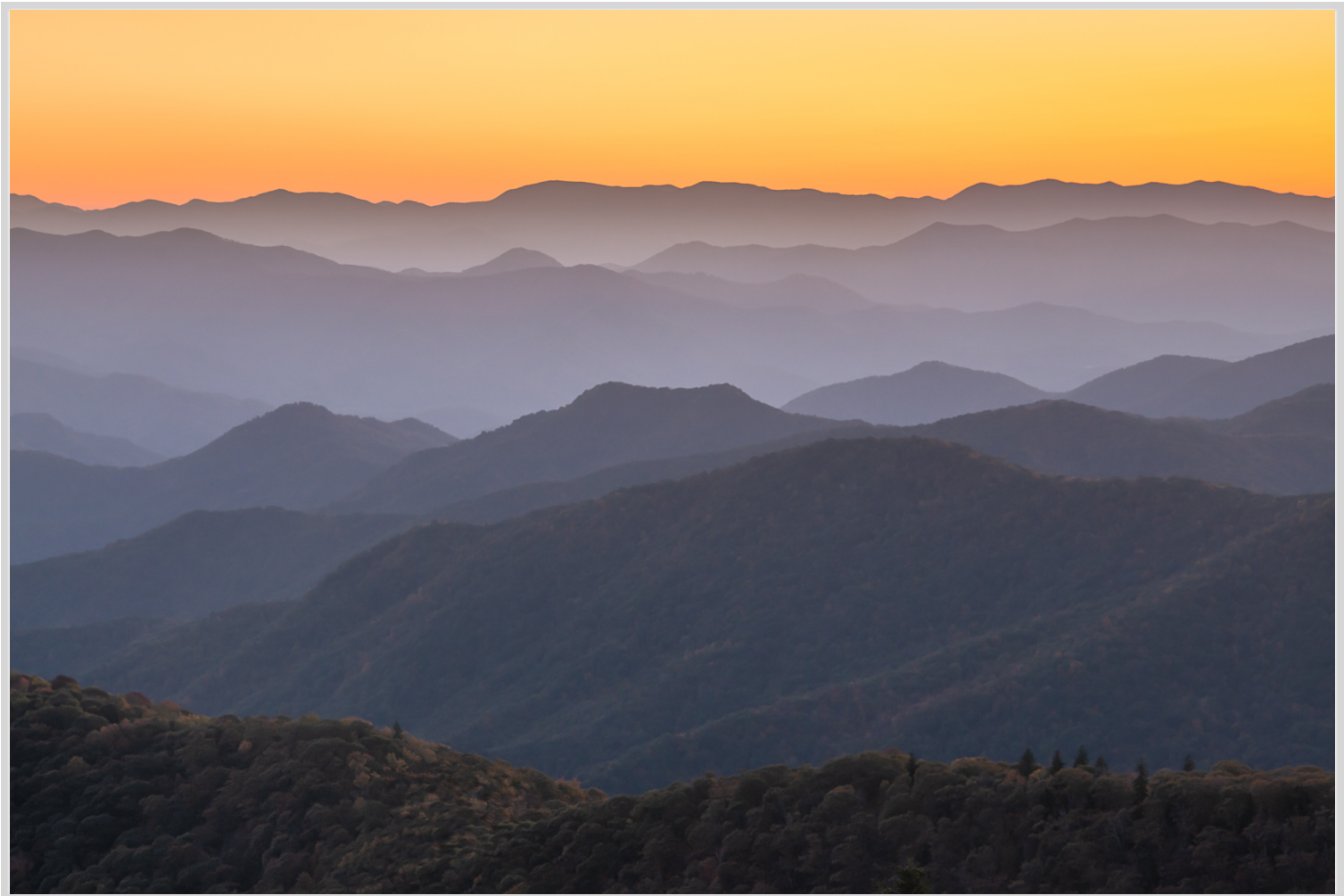
RIDGELINES AT DUSK — COWEE OVERLOOK 2020