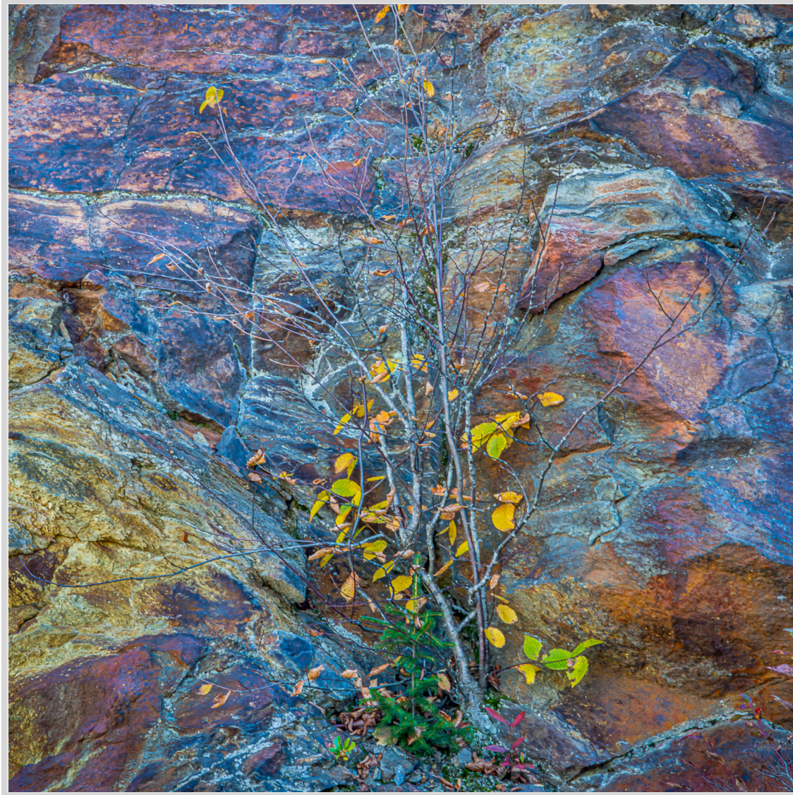
ROCK WALL AND LAST LEAVES — WATERROCK KNOB 2012