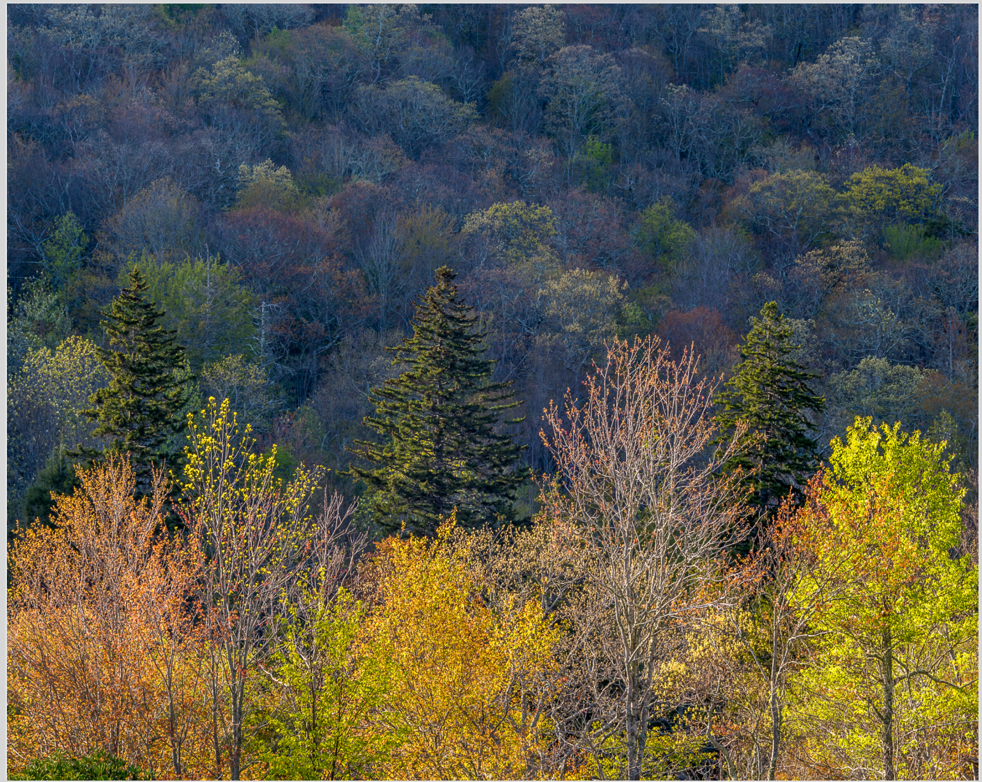
BACKLIT SPRING BUDS — SOCO GAP 2017