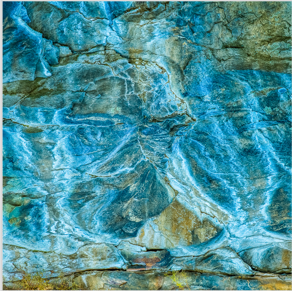
WATERSTAIN ABSTRACT — LUNCHBOX ROCK 2012