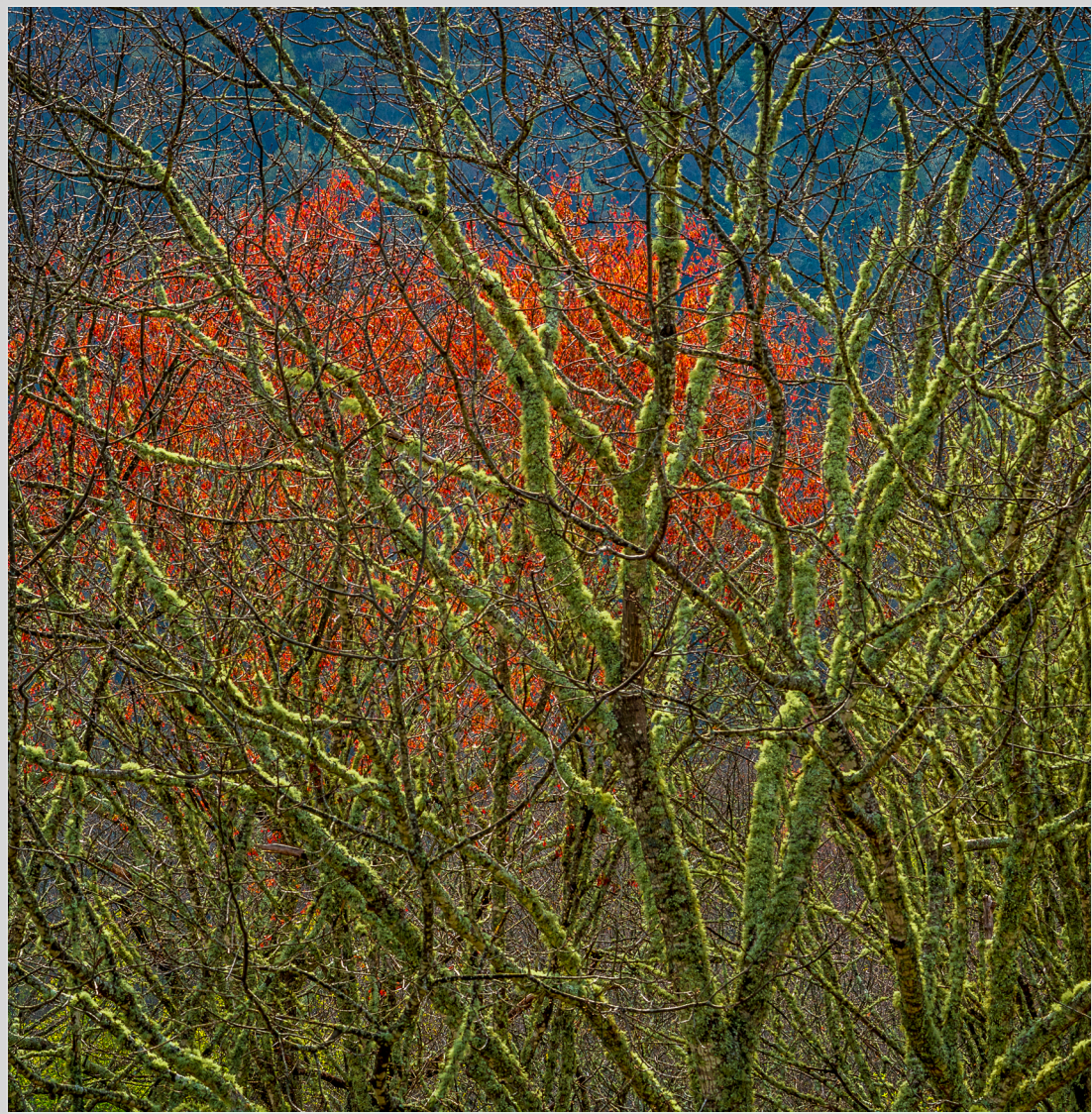
RED MAPLE BUDS AND MOSS 2015