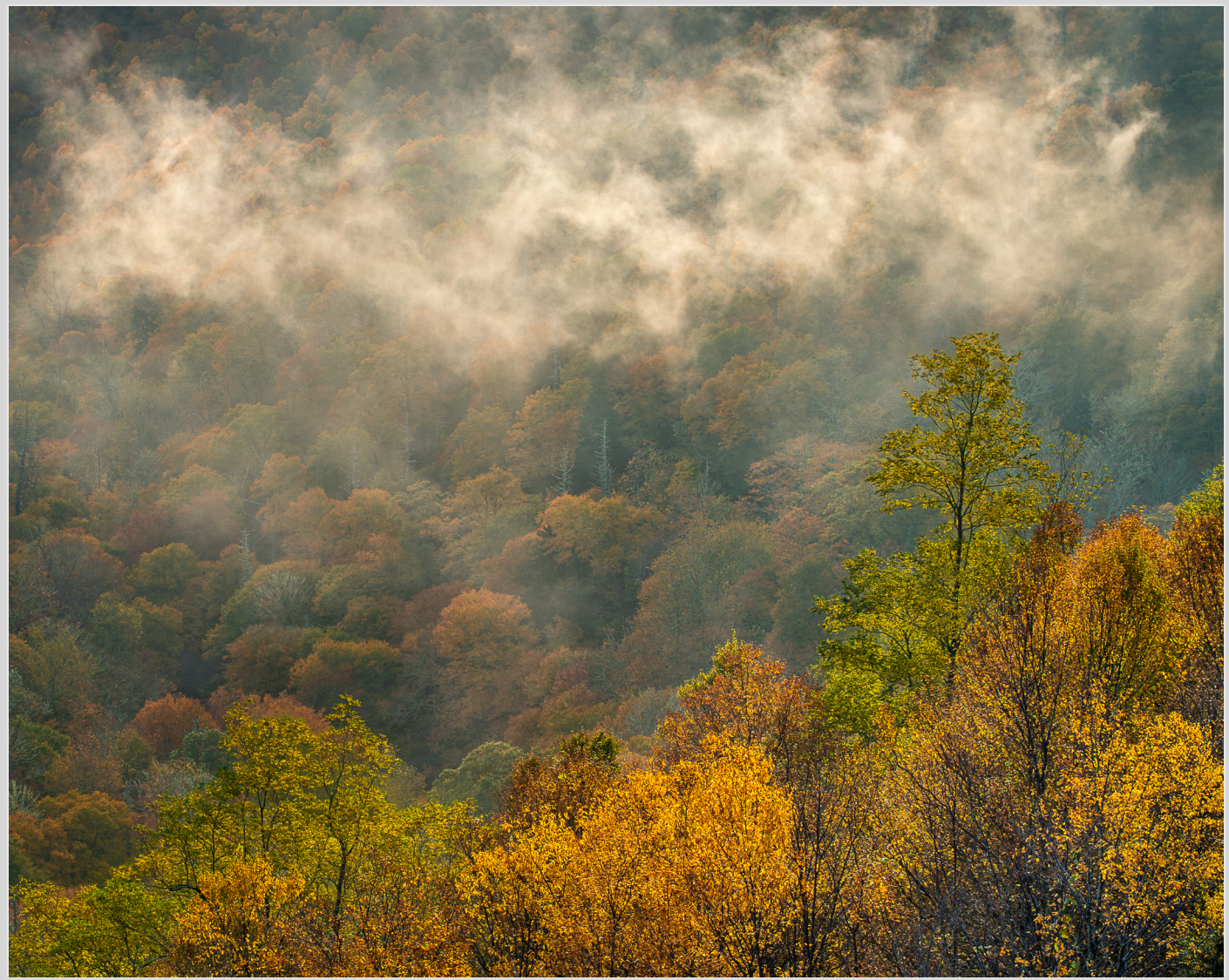
DRIFTING MIST — EAST FORK OVERLOOK 2020