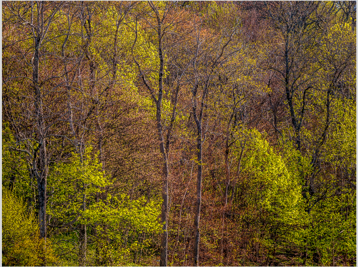
BEGINNING SPRING — GRAVEYARD FIELDS AREA 2017